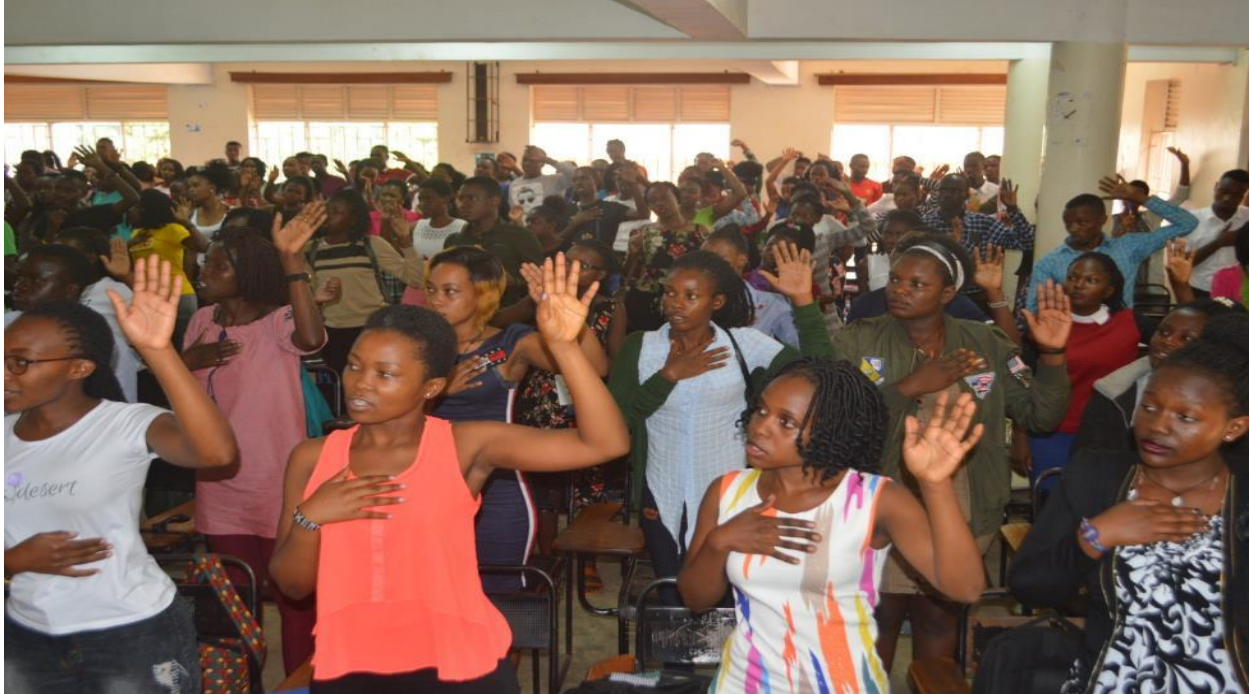
Photo credit: Makerere University COBAMS Students reciting the BANG DECLARATION in March 2019