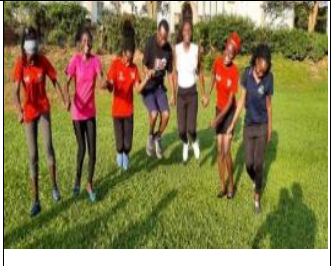
Makerere University students from the BANG clubs engaging in sports and games to keep fit and healthy

Several trainings about moral values have been held with students to enable them have the requisite skills to navigate the university life, and live morally ethical lifestyles during and after university.